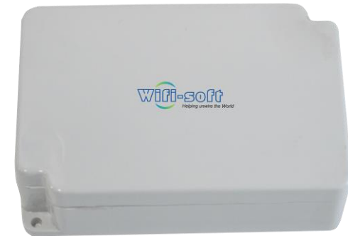
Asset Tracking Sensor

*Contact us to know about other WiFi options with presence monitoring feature