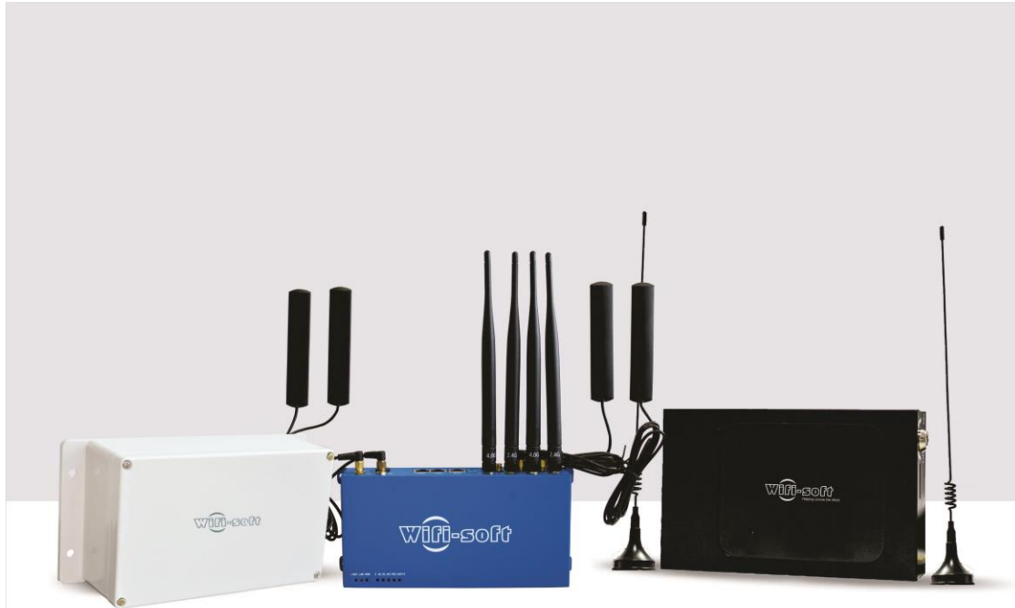
WiFi Sensor & IOT Router*